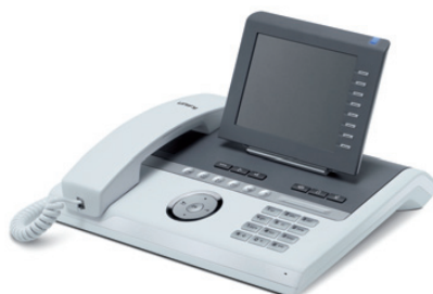
OpenStage 60 T