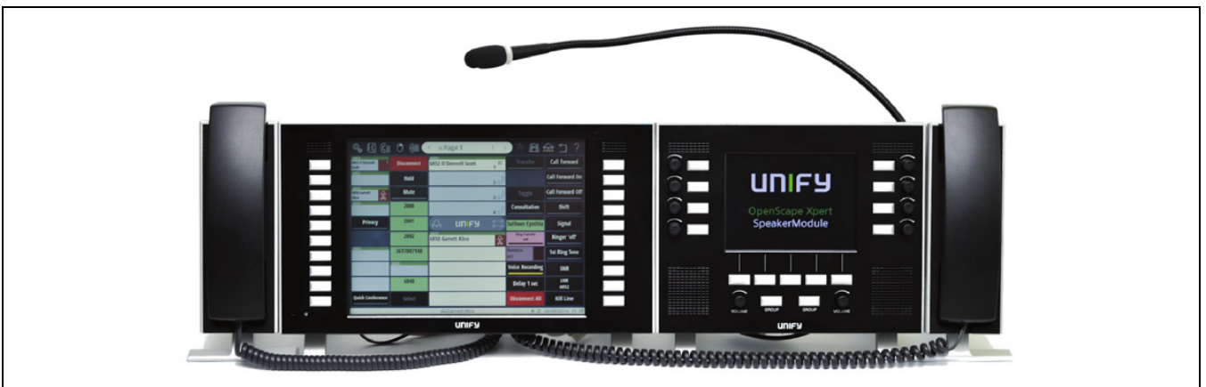
OpenScape Xpert 6010p V1 terminal

To reduce the number of moving parts and increase mean time between failures/replacement, the OpenStage Xpert device uses a compact flash card and is fanless. In addition, all of the components in the solution are compatible with VMware and can be doubled-up for redundancy and high availability.