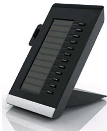
OpenScape Key Module 55