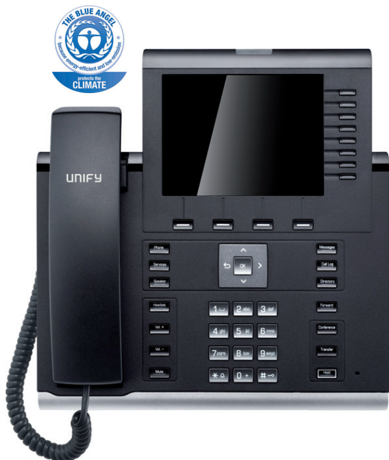
OpenScape Desk Phone IP 55G: Carbon black, text variant