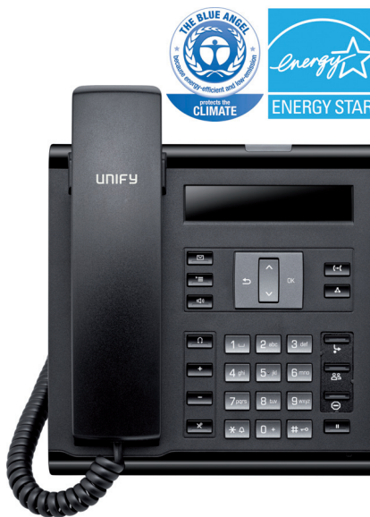
OpenScape Desk Phone IP 35G (Eco): Carbon black, symbol variant