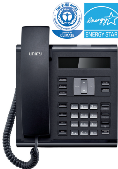
OpenScape Desk Phone IP 35G (Eco): Carbon black, text variant

The Unify product OpenScape Desk Phone IP 35G Eco has earned the ENERGY STAR.