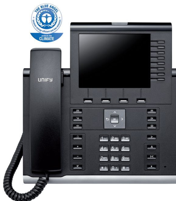
OpenScape Desk Phone IP 55G: Carbon black, symbol variant